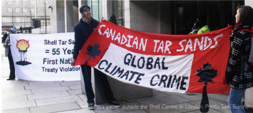
Protesters gather outside the Shell Centre in London.

The UK Tar Sands Network served papers to Shell UK executives on behalf of the Athabasca Chipewyan First Nation (ACFN) on 30 November. ACFN plans to sue Shell for failure to meet contractual agreements made between Shell and the First Nations regarding existing tar sands projects within ACFN traditional territory and Canada's pristine Athabasca, a UNESCO heritage site (see p3).