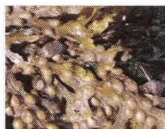
Researchers still think seaweed derivatives can aid gut health.

They used gas chromatography to measure fermentation products