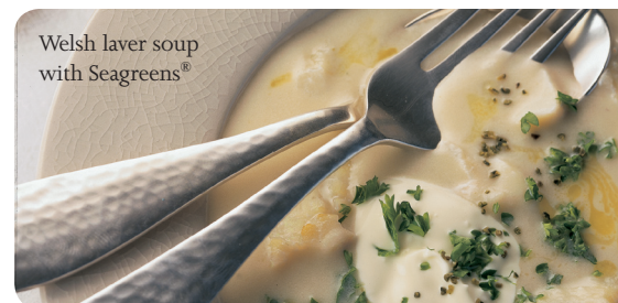
Welsh laver soup with Seagreens®

Recommended daily intake: normally 2 x 500mg capsules or 1g granules (quarter teaspoon); less for children, more in pregnancy, physical training or recuperation, and under professional guidance in detoxing, chronic health conditions and during treatment; best taken early every day with food.