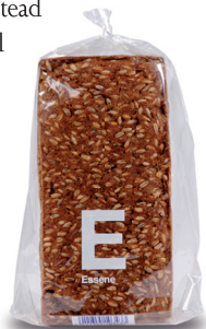
Swedish whortleberry bread with Seagreens®

Artisan were first to use Seagreens® in place of salt in their award-winning biodynamic breads.